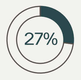
Ability to re-deploy in-house IT resources to other strategic priorities