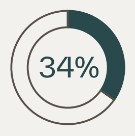
Standard and consistent delivery